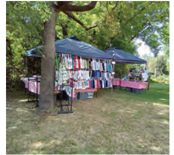
pictured on top: L - Quilts for Homeless support | R - Quilts display